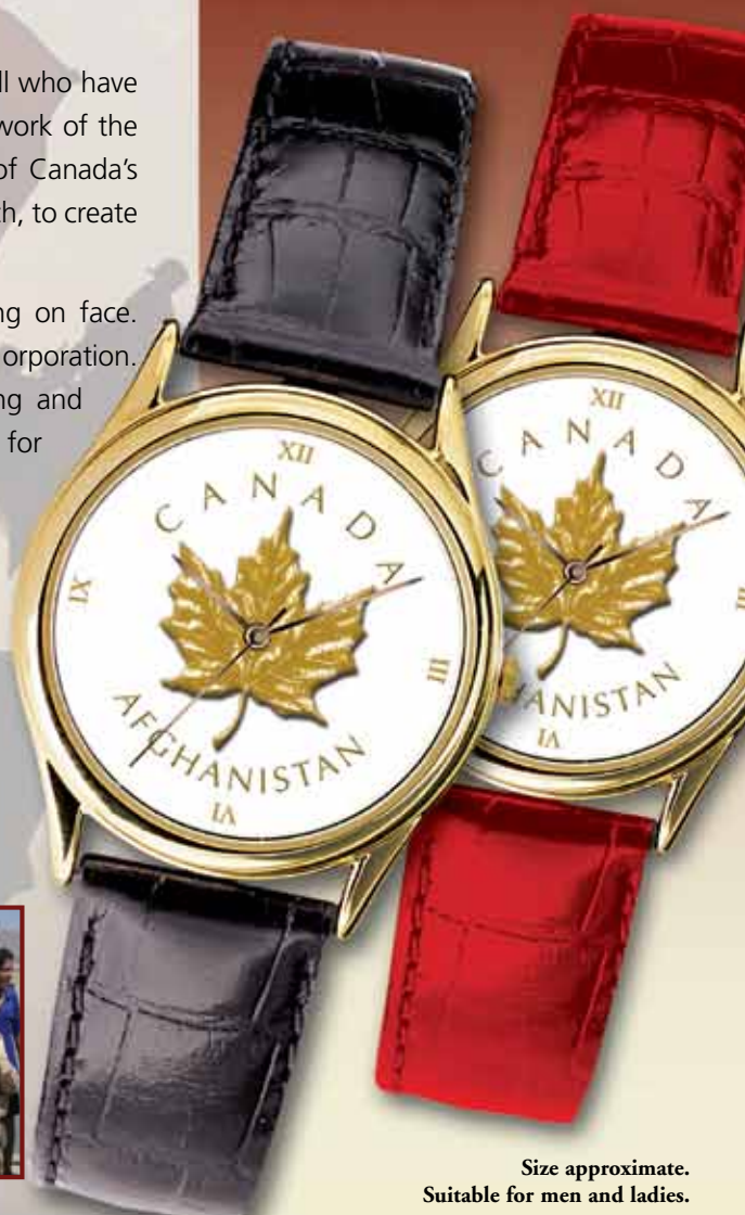
Size approximate. Suitable for men and ladies.