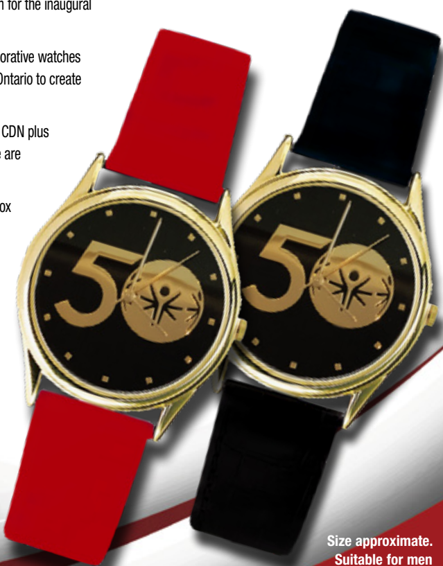
Size approximate. Suitable for men and ladies.